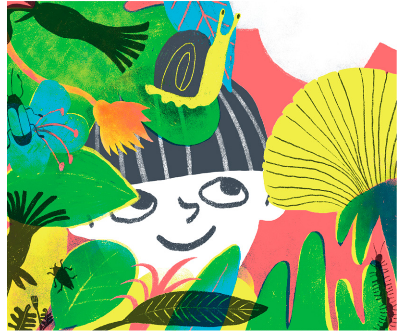
Illustration from the book The Cloud That Remains